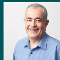
Milo Medin Google